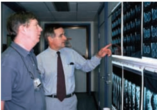
A radiologist and neurologist look at an MRI to determine if there are any new brain lesions.

Overall, first-line, disease-modifying therapies decrease the relapse rate by 30 percent and the MRI activity, as shown by the appearance of new or enlarging brain lesions, by 60 percent. Their effect on non-reversible disability accumulation and progressive brain atrophy, over the long-term, is questionable. Moreover, their tolerance and acceptability are far from ideal for a number of reasons, as outlined in the box above.