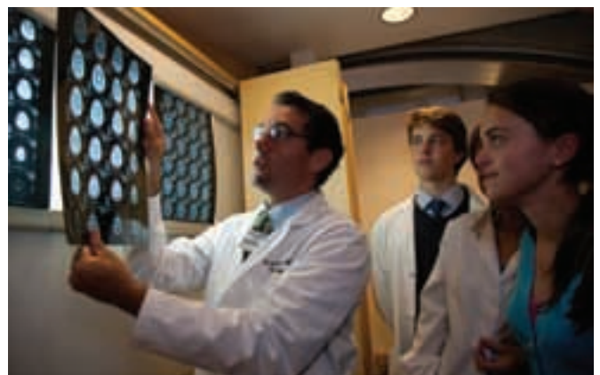
Dr Green teaching medical students

Person-centred decision-making improves adherence because it ensures that we are focused on an individual's needs and wishes.