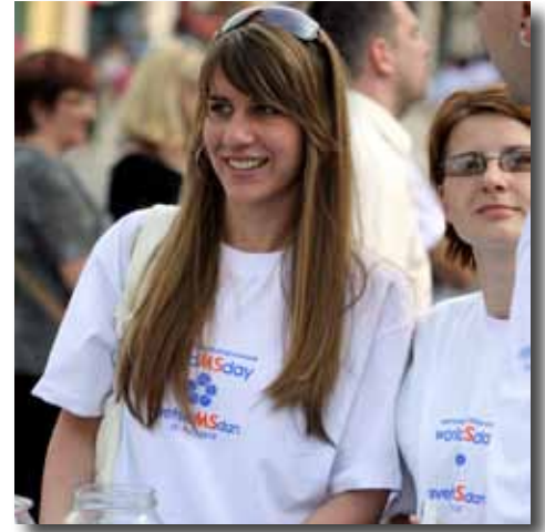
Volunteers raise funds for a regional MS society in Serbia.