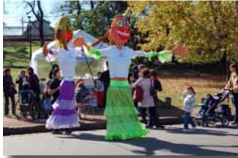
MS Argentina marked World MS Day with an information day.

More than 42,500 people became fans of the World MS Day Facebook page